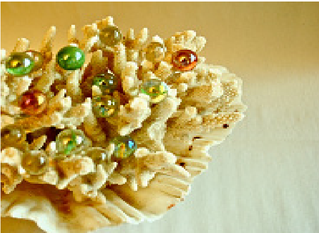
Coral Beads Skyler Oliveira Photograph