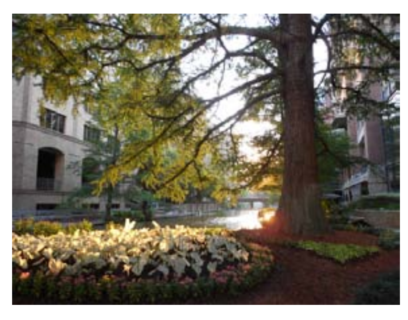
Garden Some One

until my time empties its sands i'll have the will to do this.