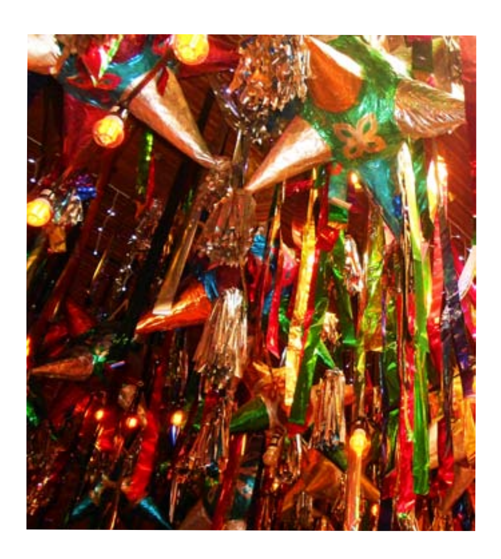
Fiesta Skyler Oliveira Photograph