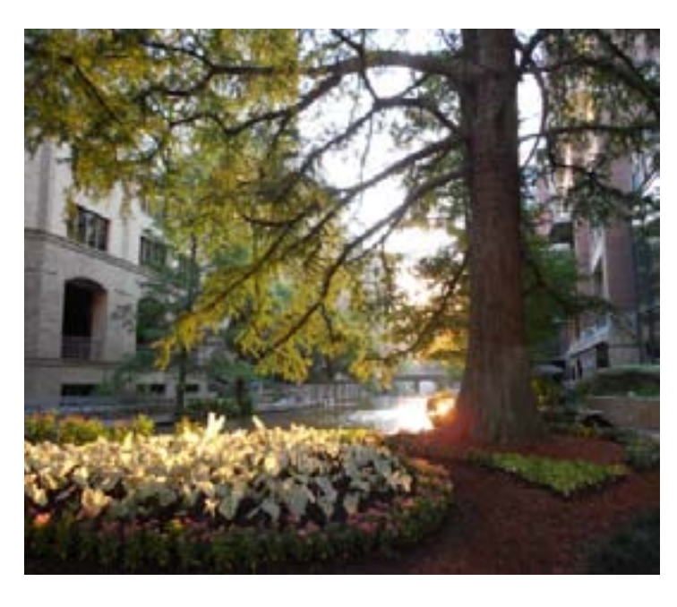
Summer Peace Skyler Oliveira Photograph

everyone around me is losing their vision they don't ask me but I make them each a pair of glasses from my own bones plucking them out of me and carving them until they are a perfect fit soon there are no more of my white bones left and I give my own glasses away I become blind and spineless.